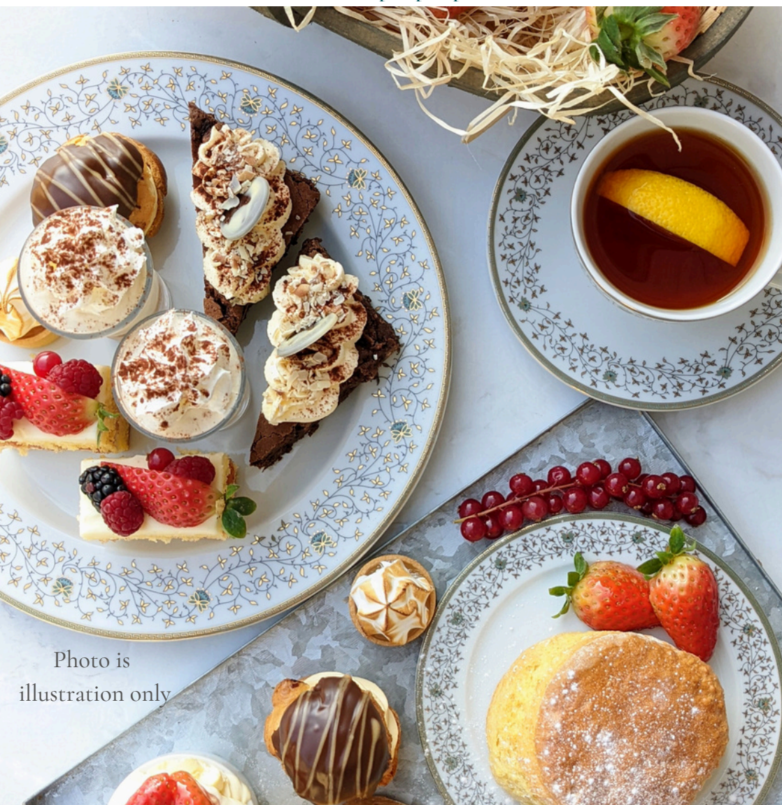
Photo is illustration only

Afternoon tea for minimum of two people gift wrapped for the ultimate treat. Our boxes include finger cut sandwiches, freshly made scones with clotted cream, award winning strawberry jam and a seasonal selection of cakes and mini puddings, completed with a selection of teabags £22/ person Minimum of 2 people per order